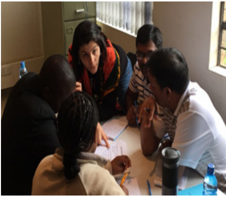
Trainees working together in teams during the 2016 Kenya course