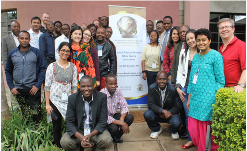
Trainees and lecturers in Nairobi, Kenya for the 2016 major course "Clinical Trials in a Developing Country Setting"

The following 4 days of the course were spent in the classroom. During the theory component, the trainees gained insight into the complexity of organizing and running a clinical trial, as well as, the importance of community engagement in the overall process. They learned that involving peer leaders, church leaders and chiefs can prevent miscommunication about the trial and increase the overall participation in the trial.