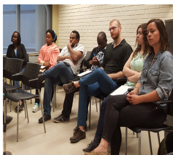
Above: Winnipeg site during one of the Infectious Minds group activities