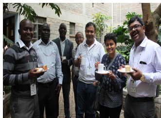
The trainees enjoying Tea time during the Kenya course