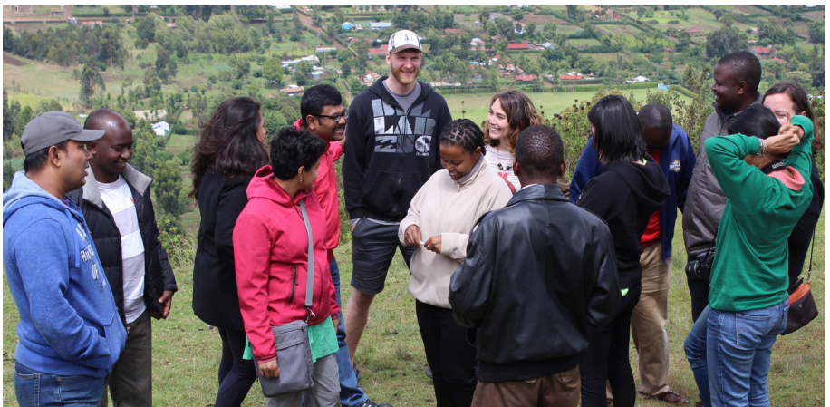
The trainees made a pit stop on their way to their clinical trial learning sites in rural Kenya to enjoy the views of the Rift Valley, Kenya