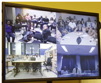
Split screen view of the trainees and mentors from the four research sites during an Infectious Minds Meeting. Clockwise from top left: Winnipeg, Canada; Medellin, Colombia; Nairobi, Kenya; and Bangalore, India