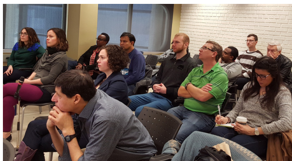
Left: Winnipeg site during an Infectious Minds meeting