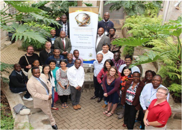
The IID&GH Training Program in Nairobi, Kenya for the major course, “Clinical Trials in a Developing Country Setting” November 14-25, 2016