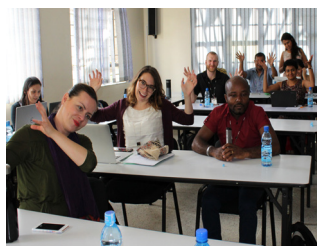
The trainees having fun during one of the Kenya course sessions

Swaroop N Dimensions and determinants of Quality of Life (QoL)